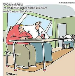
The old good-cop, painfully shy-cop routine.

Sets out requirements for detention, treatment & questioning of suspects